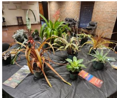
Bromeliads for all attendees