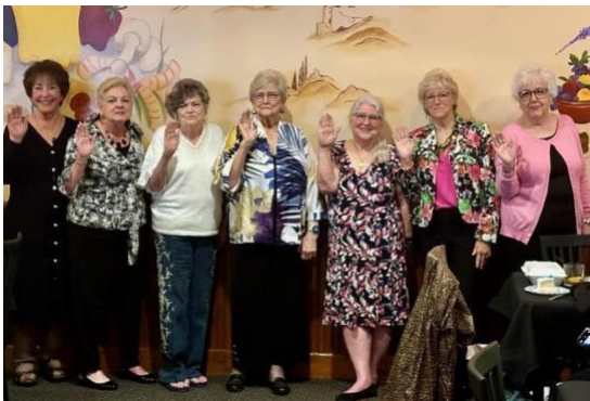
Installation of Officers 2024-2025