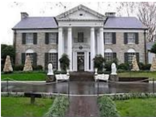
Graceland Memphis, TN