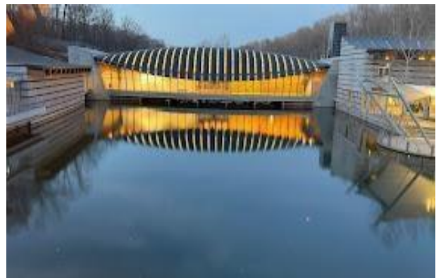
Crystal Bridges Museum Bentonville, AR