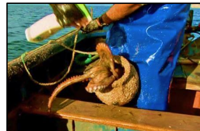
Pottery Jars Trap Octopus Salema, The Algarve

Lisbon’s history goes back to the Roman times, but the city’s glory days were the 15 th and 16 th centuries when Vasco da Gama sailed around Africa and opened new trade routes to India, making Lisbon one of Europe’s wealthiest cities. It was an economic and cultural boom time. In the early 1700s the gold and diamonds of Brazil, one of Portugal’s colonies, made Lisbon even wealthier.