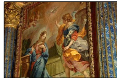
Mosaics in Chapel of St. John Do Not Darken from Candles as Paintings Do, Lisbon