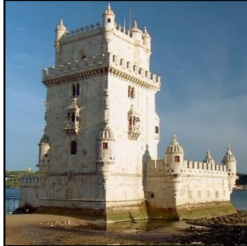
Belém Tower Is Last Thing Sailors See When Leaving Lisbon and First Thing When Returning