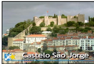
Castelo São Jorge Lisbon