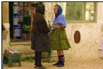
Women Wear 7 Petticoats For Flexible Warmth, Nazaré