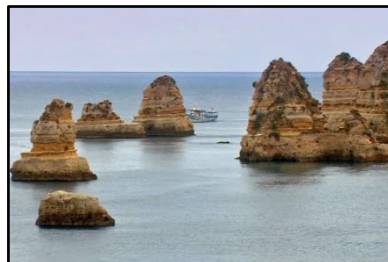
Cliffs in Lagos The Algarve