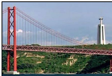
1.5 Mile Bridge Over Tejos River and Christ Statue, Lisbon