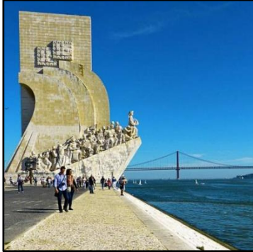
We Monument to Sailors Lisbon