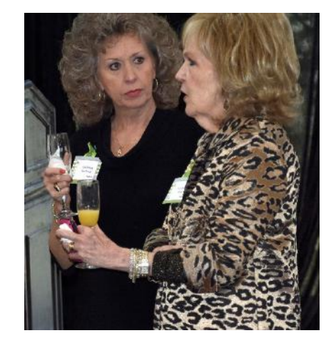
Catching up and discussing what to buy