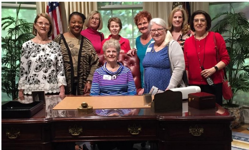
March Day trip to the Bush Museum