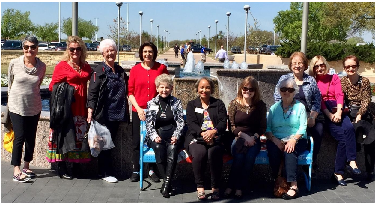
March Day Trip to the Bush Museum